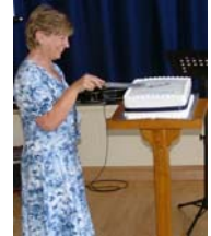
cutting the cake

Amidst the reports and laughter and food, there was a word of warning given by our last speaker of the day. We should not be like Joshua who took success for granted and didn't consult the Lord. We should seek the Lord at all times as we move ahead, and not assume that what we have done before we will do next time. None of us reading this newsletter knows what the future holds - even tomorrow, but we commit our lives and our work to God and trust Him to guide us. As we begin our second decade, EPIC is dedicated to continuing the vision to put churches together for mutual benefit, and to provide material help for Christians in Eastern Europe.