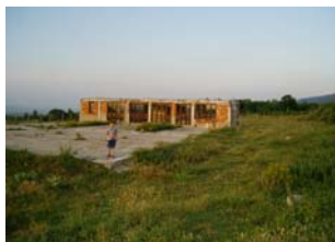
The camp last year

A very successful exchange visit this summer was between a church in the south of Bulgaria and one in Suffolk. Ivan, the pastor has two 'dreams'. One is for a camp for children and he is busy renovating a derelict building to be a permanent centre. The other is for a health clinic for his village and work will begin shortly to build two rooms onto the side of the church. Two nurses from the congregation will run it, and consultations and medicines will be free of charge thanks to funds and equipment from England.