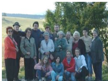
Some of the members of New Hope Church

" We will have time for lessons, prayer meetings, and sharing ideas of ministry in central and East Bosnia. Our church is making big and important step to become church with a mission orientation. We should like to show to others that they should not wait for someone else to take care of church planting in their own country. Bosnians have to become more active in making important steps. We are very excited and we hope to have beautiful and blessed time, please be with us in prayer"